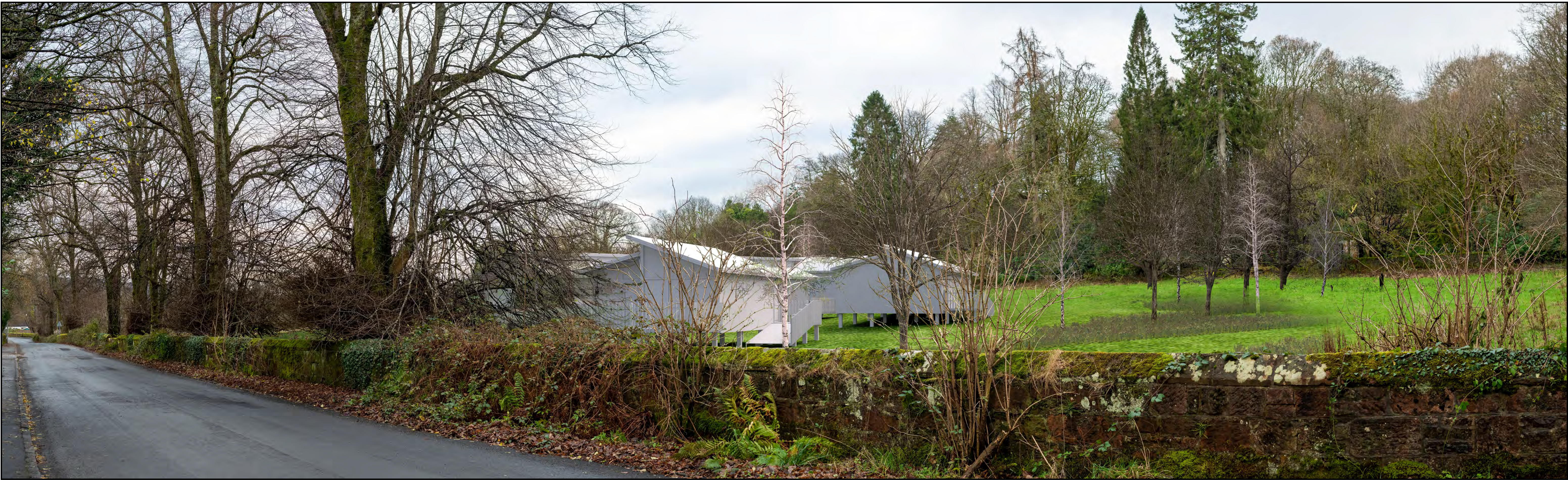
Grid Ref: 56.OO3883, -4.597872; General Direction of View: South 166°; Date & Time of Photograph – 08/12/21 @ 15.07; Weather/Visibility – Cloudy/Good; Camera – Nikon D810, AF-S NIKKOR 50mm f/1.4G Fixed Lens

TYPE 3 VISUALISATION – AVR LEVEL 2 – WINTER (90° FIELD OF VIEW)