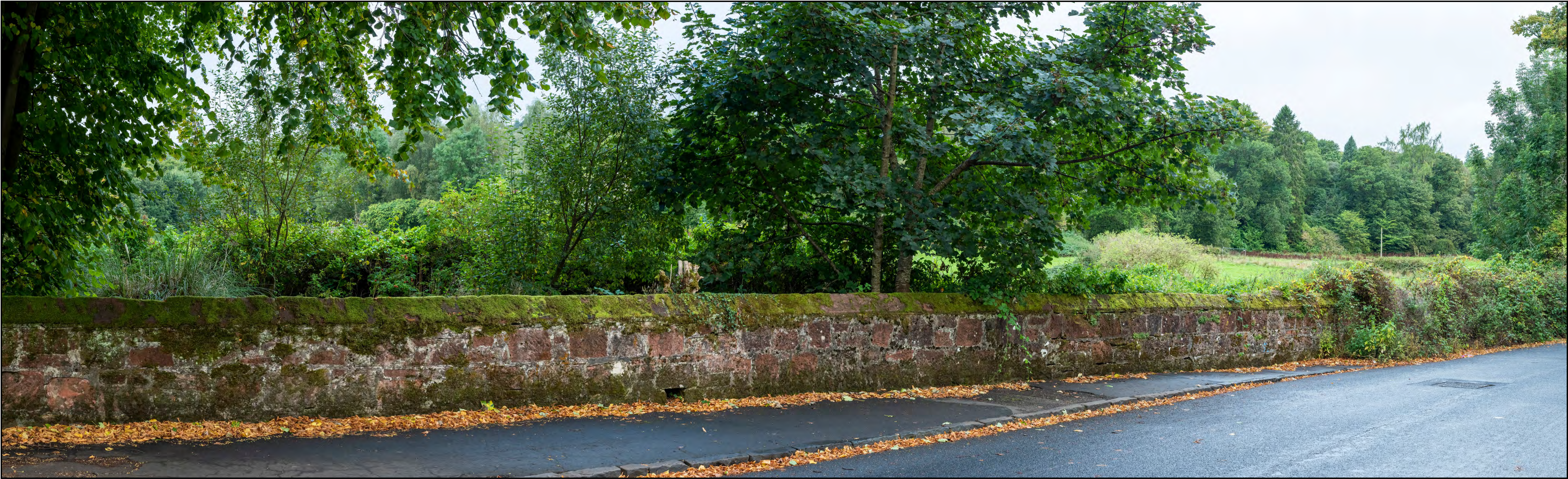
Grid Ref: 56.OO2347, -4.594195; General Direction of View: West 243°; Date & Time of Photograph – 23/09/21 @ 16.38; Weather/Visibility – Rain/Poor; Camera – Nikon D810, AF-S NIKKOR 50mm f/1.4G Fixed Lens

PHOTOGRAPH OF EXISTING LANDSCAPE FROM VIEWPOINT – SUMMER (90° FIELD OF VIEW)