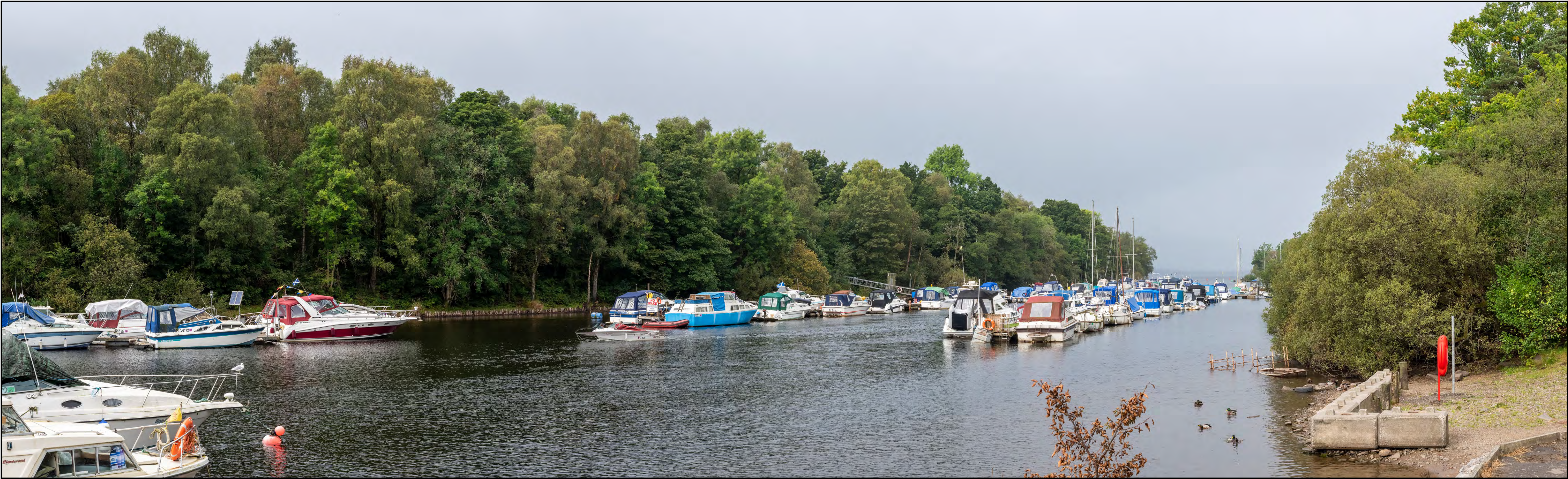
Grid Ref: 56.OO5117, -4.582597; General Direction of View: North-West 295°; Date & Time of Photograph – 23/09/21 @ 13.17; Weather/Visibility – Rain/Poor; Camera – Nikon D810, AF-S NIKKOR 50mm f/1.4G Fixed Lens

PHOTOGRAPH OF EXISTING LANDSCAPE FROM VIEWPOINT – SUMMER (90° FIELD OF VIEW)