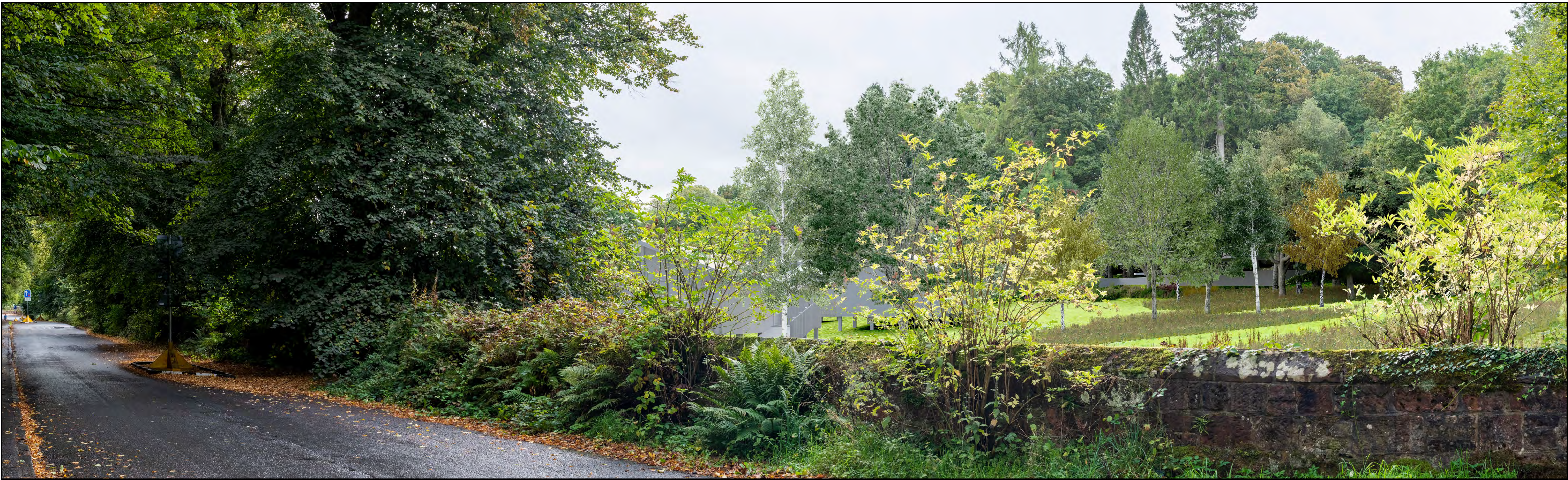
Grid Ref: 56.OO3883, -4.597872; General Direction of View: South 166°; Date & Time of Photograph – 24/09/21 @ 12.40; Weather/Visibility – Overcast/Poor; Camera – Nikon D810, AF-S NIKKOR 50mm f/1.4G Fixed Lens

TYPE 3 VISUALISATION – AVR LEVEL 2 – SUMMER (90° FIELD OF VIEW)