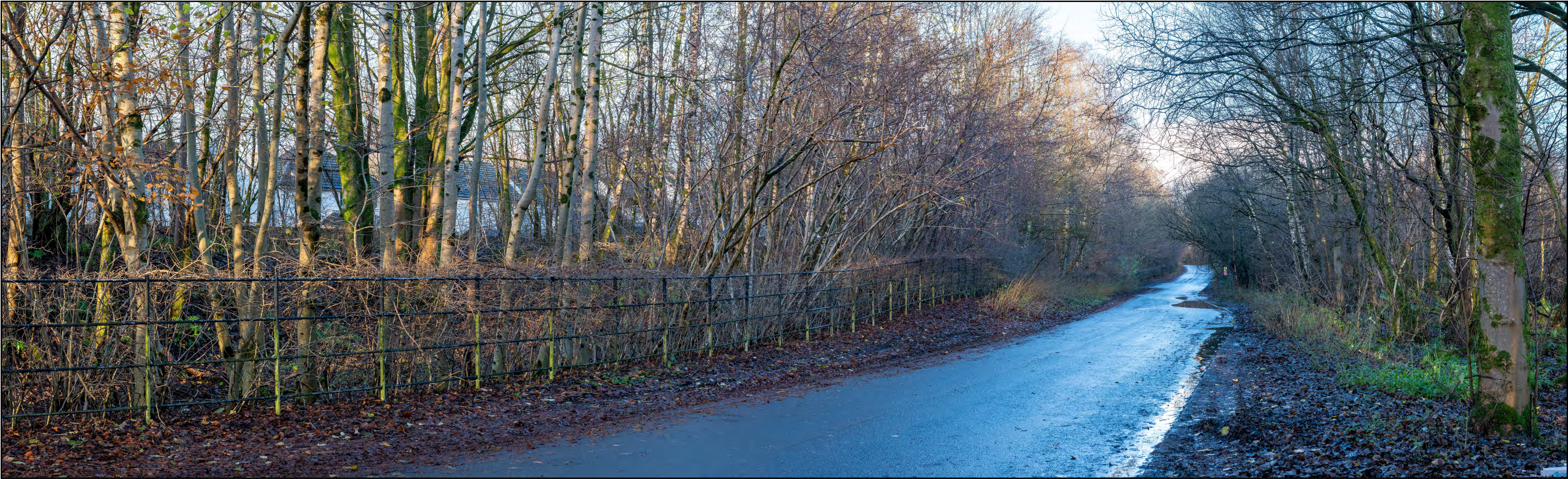
Grid Ref: 56.OO3989, -4.585403; General Direction of View: North-West 300°; Date & Time of Photograph – 10/12/21 @ 10.30; Weather/Visibility – Sunny/Excellent; Camera – Nikon D810, AF-S NIKKOR 50mm f/1.4G Fixed Lens

PHOTOGRAPH OF EXISTING LANDSCAPE FROM VIEWPOINT – WINTER (90° FIELD OF VIEW)