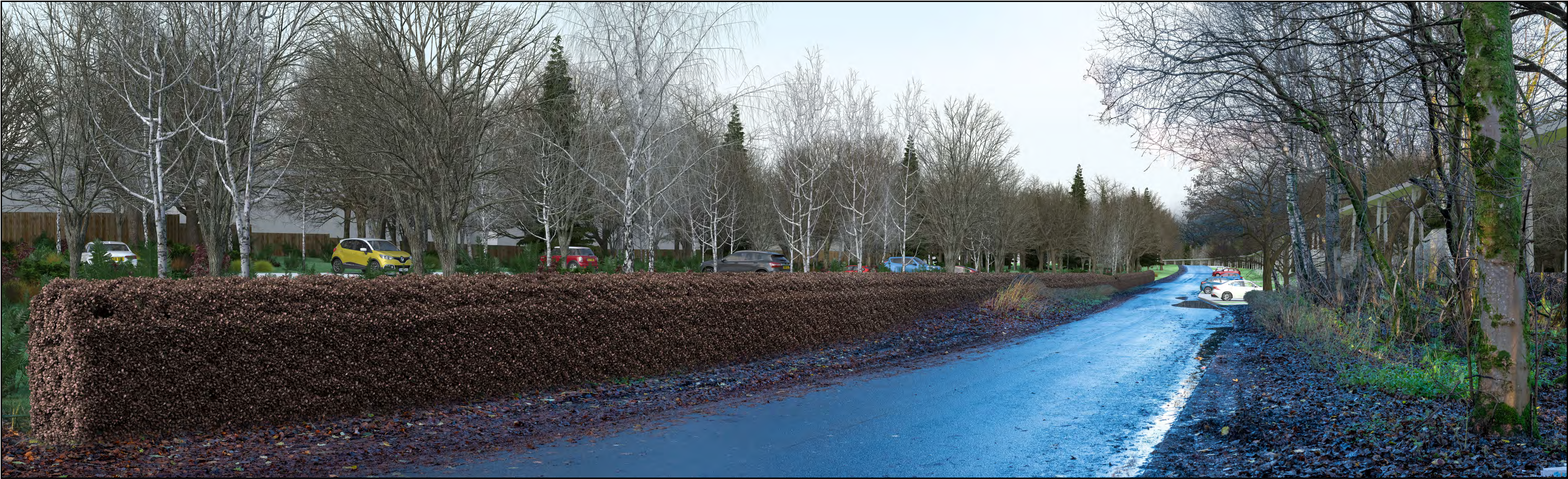
Grid Ref: 56.OO3989, -4.585403; General Direction of View: North-West 300°; Date & Time of Photograph – 10/12/21 @ 10.30; Weather/Visibility – Sunny/Excellent; Camera – Nikon D810, AF-S NIKKOR 50mm f/1.4G Fixed Lens

TYPE 3 VISUALISATION – AVR LEVEL 2 – WINTER (90° FIELD OF VIEW)