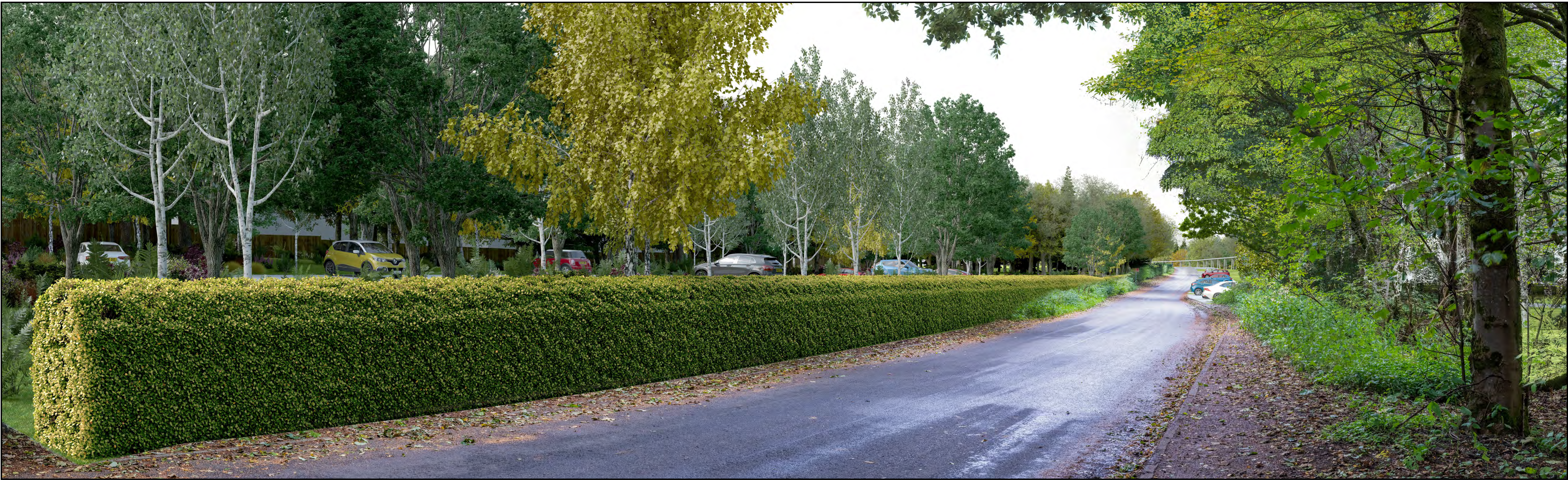
Grid Ref: 56.OO3989, -4.585403; General Direction of View: North-West 300°; Date & Time of Photograph – 23/09/21 @ 14.42; Weather/Visibility – Rain/Poor; Camera – Nikon D810, AF-S NIKKOR 50mm f/1.4G Fixed Lens

TYPE 3 VISUALISATION – AVR LEVEL 2 – SUMMER (90° FIELD OF VIEW)