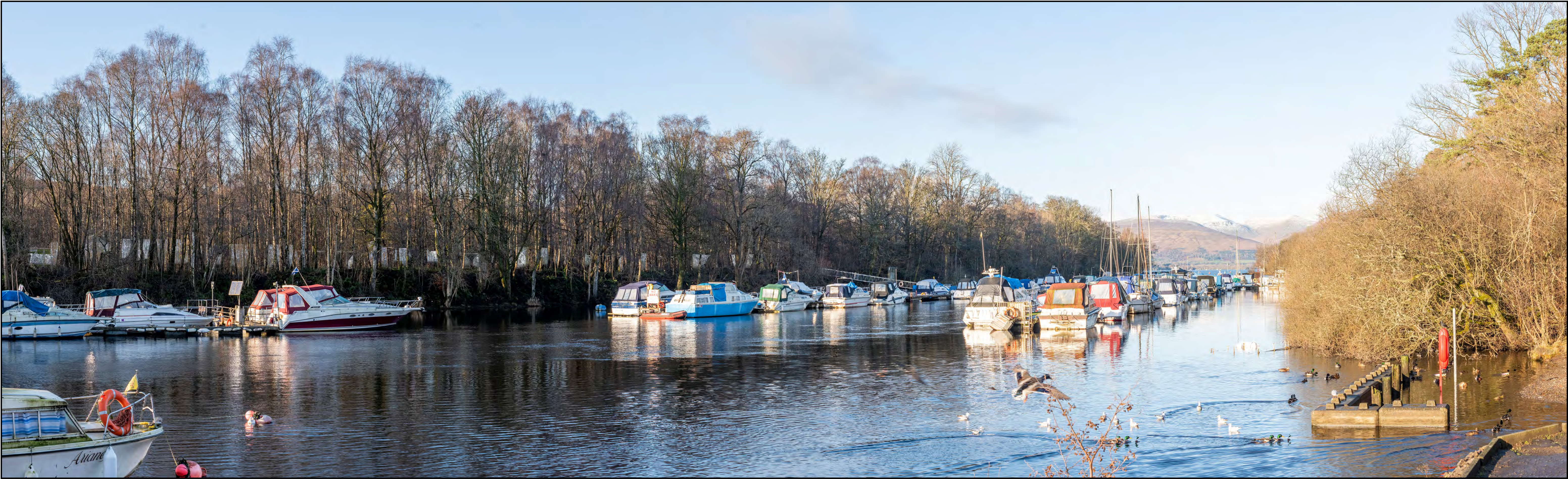
Grid Ref: 56.OO5117, -4.582597; General Direction of View: North-West 295°; Date & Time of Photograph – 10/12/21 @ 12.10; Weather/Visibility – Sunny/Excellent; Camera – Nikon D810, AF-S NIKKOR 50mm f/1.4G Fixed Lens

TYPE 3 VISUALISATION – AVR LEVEL 2 – WINTER (90° FIELD OF VIEW)