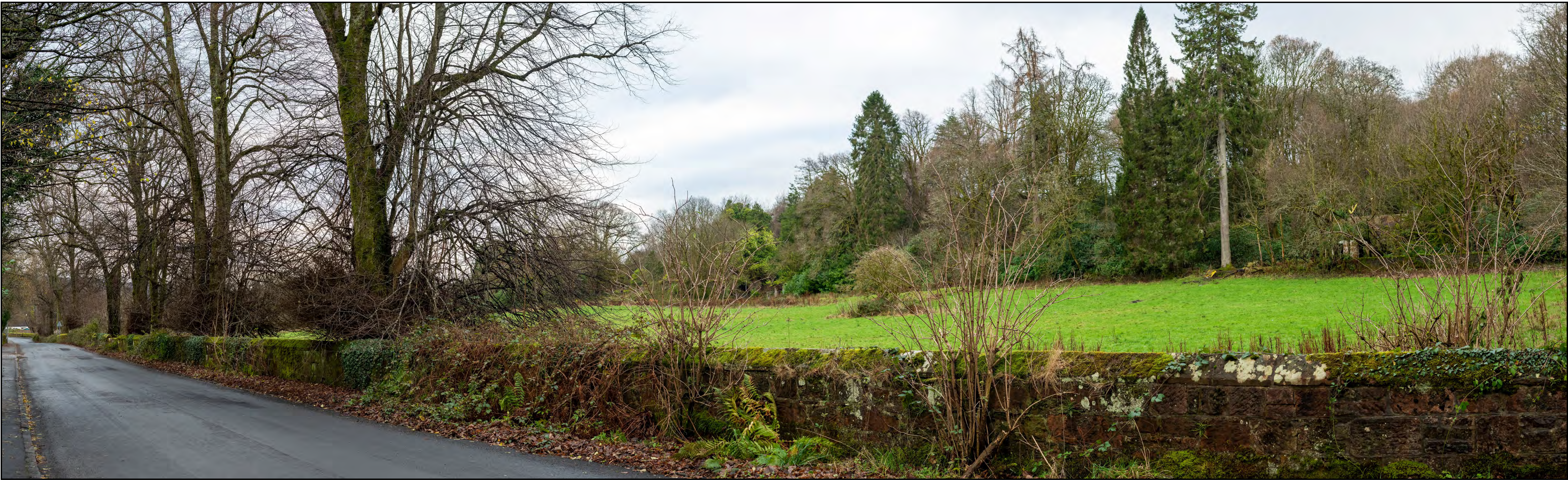
Grid Ref: 56.OO3883, -4.597872; General Direction of View: South 166°; Date & Time of Photograph – 08/12/21 @ 15.07; Weather/Visibility – Cloudy/Good; Camera – Nikon D810, AF-S NIKKOR 50mm f/1.4G Fixed Lens

PHOTOGRAPH OF EXISTING LANDSCAPE FROM VIEWPOINT – WINTER (90° FIELD OF VIEW)