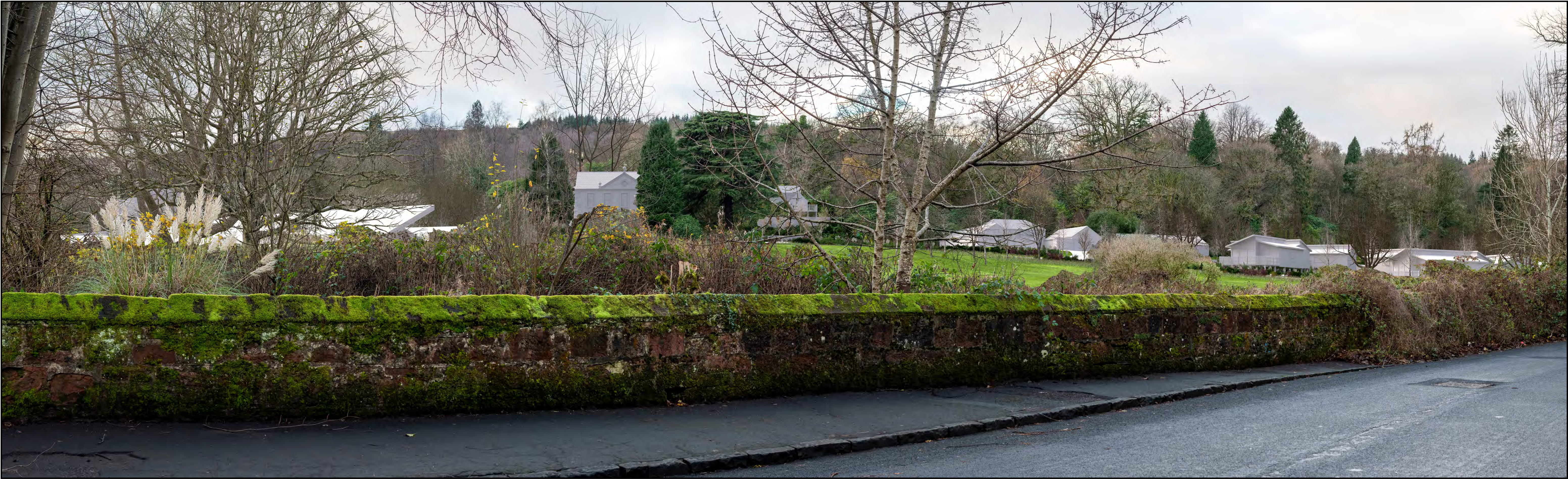
Grid Ref: 56.OO2347, -4.594195; General Direction of View: West 243°; Date & Time of Photograph – 08/12/21 @ 15.42; Weather/Visibility – Cloudy/Good; Camera – Nikon D810, AF-S NIKKOR 50mm f/1.4G Fixed Lens

TYPE 3 VISUALISATION – AVR LEVEL 2 – WINTER (90° FIELD OF VIEW)