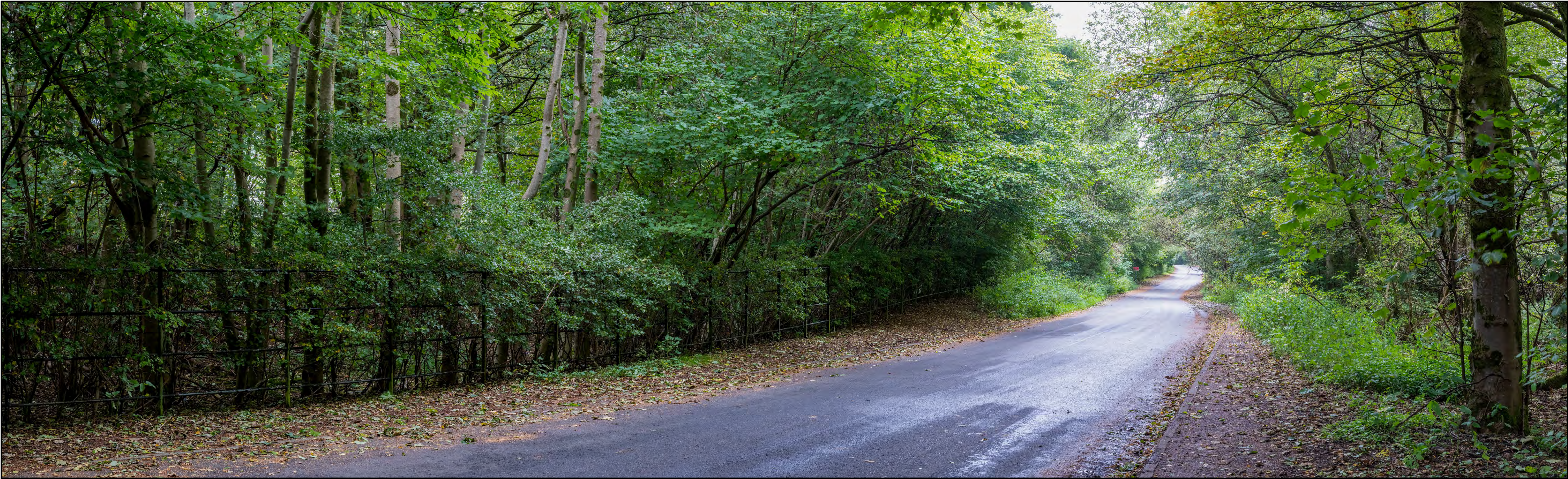
Grid Ref: 56.OO3989, -4.585403; General Direction of View: North-West 300°; Date & Time of Photograph – 23/09/21 @ 14.42; Weather/Visibility – Rain/Poor; Camera – Nikon D810, AF-S NIKKOR 50mm f/1.4G Fixed Lens

PHOTOGRAPH OF EXISTING LANDSCAPE FROM VIEWPOINT – SUMMER (90° FIELD OF VIEW)