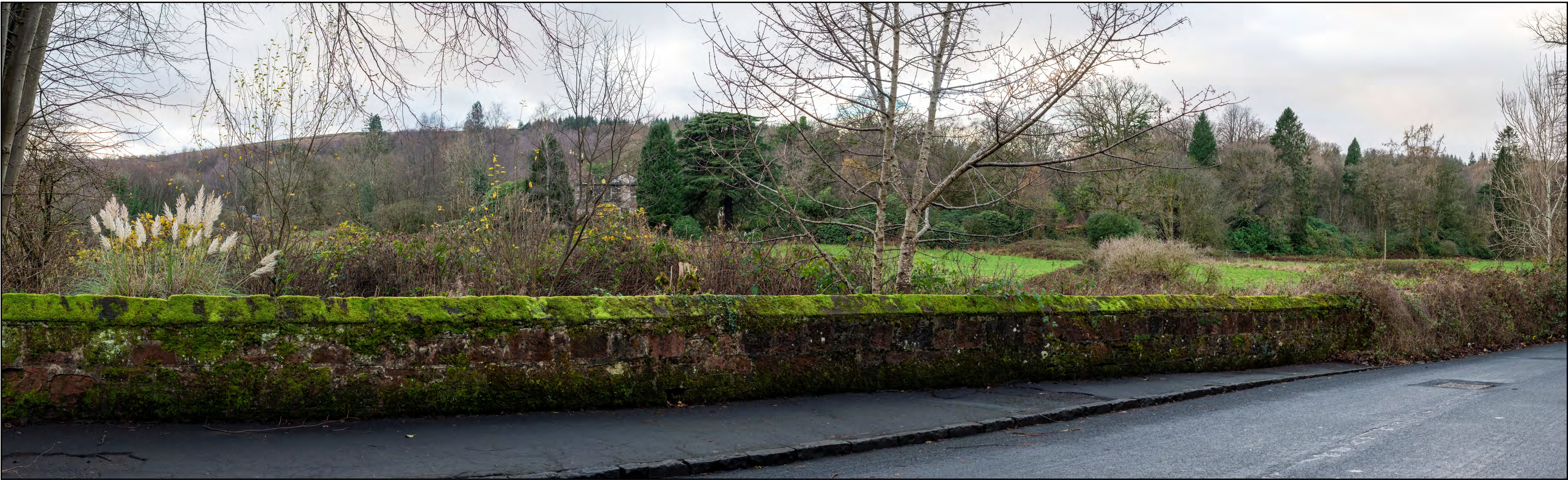
Grid Ref: 56.OO2347, -4.594195; General Direction of View: West 243°; Date & Time of Photograph – 08/12/21 @ 15.42; Weather/Visibility – Cloudy/Good; Camera – Nikon D810, AF-S NIKKOR 50mm f/1.4G Fixed Lens

PHOTOGRAPH OF EXISTING LANDSCAPE FROM VIEWPOINT – WINTER (90° FIELD OF VIEW)